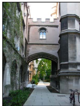
Franke Institute for the Humanities