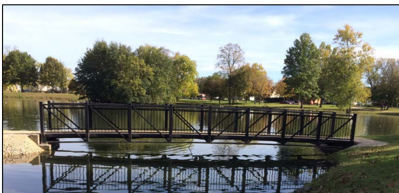
East Lagoon South Bridge

The Division of International Affairs celebrates International Education Week Nov. 13–17 with international foods in the Blackhawk Food Court and residence halls, various events, and more , including several CSEAS activities. CSEAS will be fielding daily Southeast Asian language tables in DuSable Hall from 10 a.m. to noon Monday (Burmese),