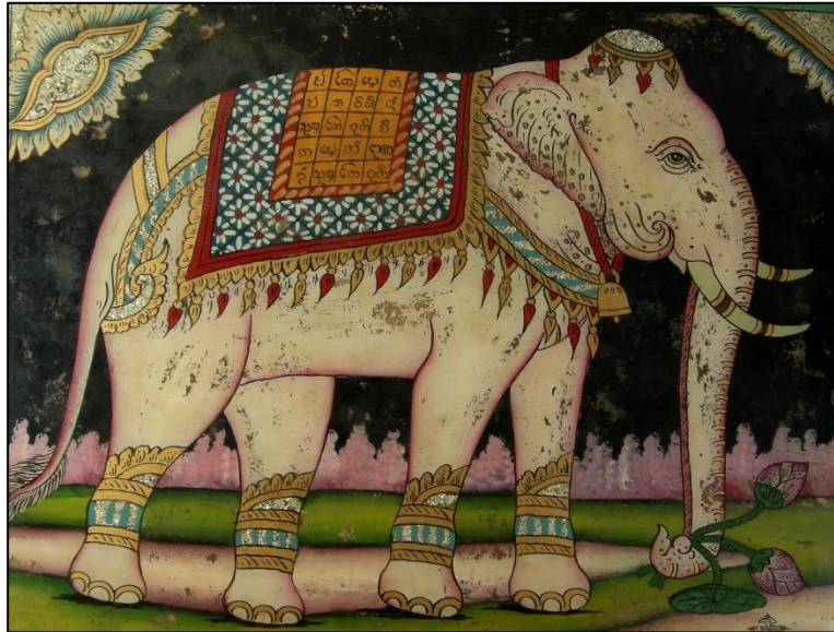
White Elephant, Thailand, an early 20 th century reverse glass painting, will be part of the exhibition of Buddhist reverse glass paintings opening at the NIU Art Museum this week. Details below.

Center for Southeast Asian Studies at Northern Illinois University • Week of November 12, 2018